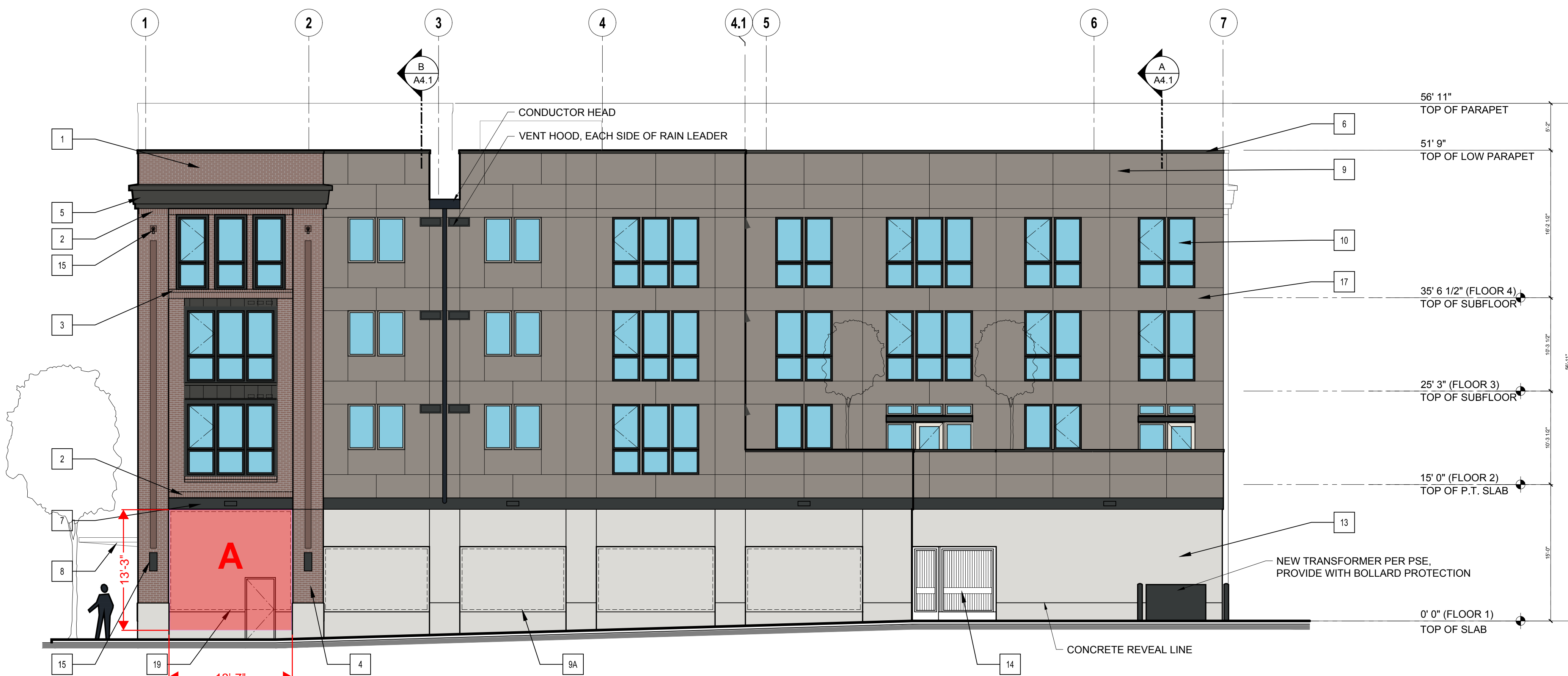
3 ELEVATION - NORTH SCALE: 1/8" = 1'-0"