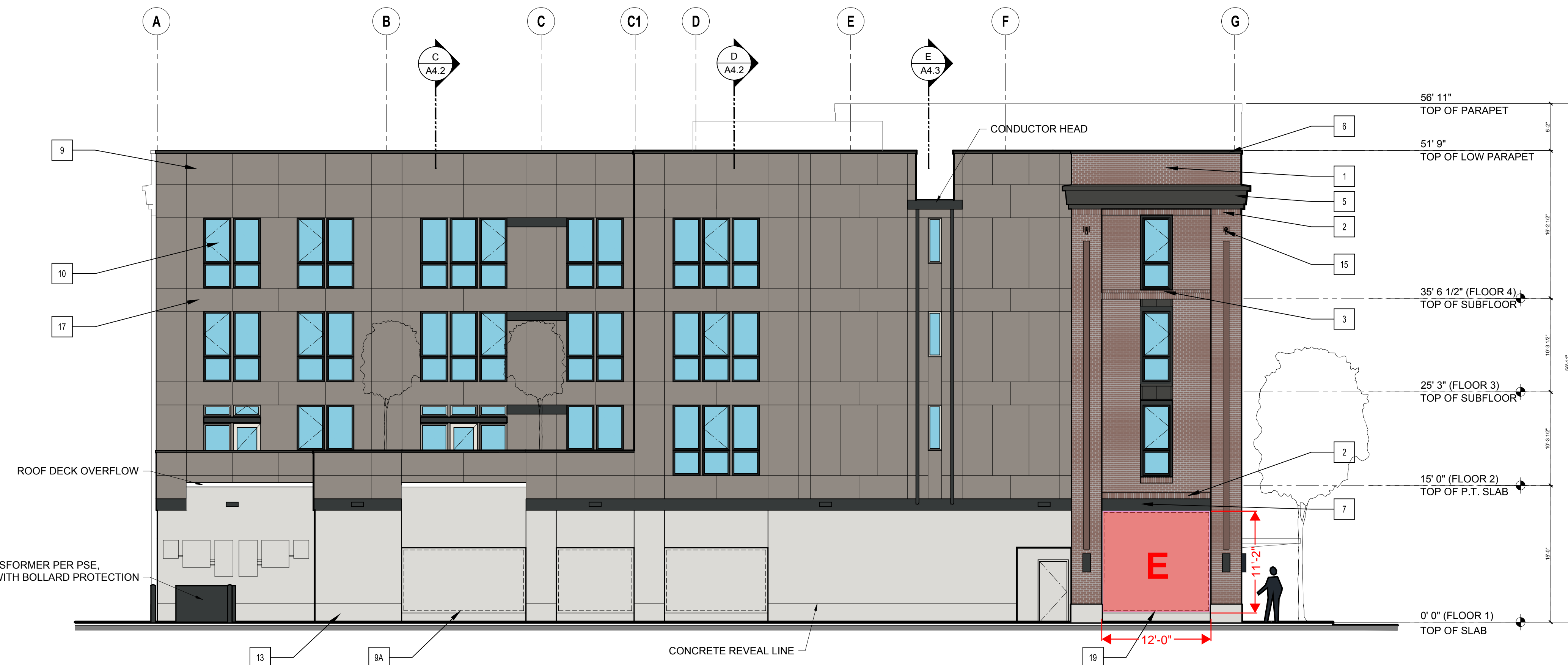
4 ELEVATION - WEST SCALE: 1/8" = 1'-0"